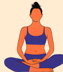
Bound Angle Pose